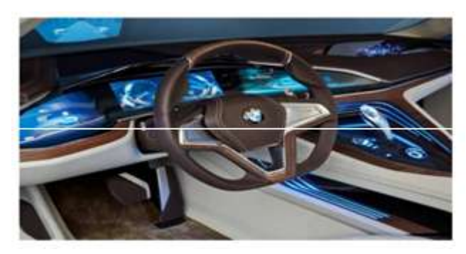
Fig. 12: BMW harnessing the cognitive abilities of IBM Watsonvi) Infotainment System

Insights wanted be drawn from plenty of formless data to decide on how to answer naturally in actual time. Cognitive capabilities wanted be able to switch dynamic operating circumstances as well. Car manufacturers have previously started integrating this into their automobiles.