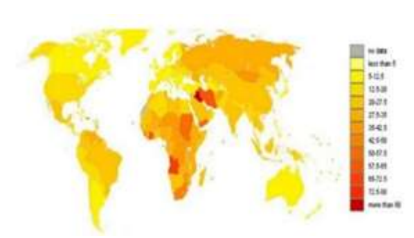
Fig. 4: Road Fatalities per Capital (WHO) ii)Grand Theft Auto

(World report on road traffic injury prevention, WHO, 2004).