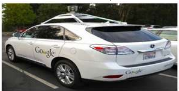
Fig. 8: Autonomous car under development by

depicted in pictures over the centuries, have continuously taken our thoughts. But the lack of technical brilliance and resources probably kept it from becoming a reality, until recently. Eventually, all the factors leading to artificial intelligence shaped up and now driverless cars have become a reality. Well, virtually, it is impartial a substance of time beforehand you start to see real intellect in them. The idea is to authorize the automobile to act like a humanoid motorist and ambition finished various conditions. This may complete easy, but is in not at all method a simple job since a lot of careful calculating is obligatory. Through methods like sensor fusion and deep learning, researchers could develop a technology that would help build a threedimensional map of all the activities that happen around the car. Some of the leading tech and automotive giants like Google and Tesla are spending millions of dollars in research to come up with better technology and to make autonomous cars a commercial reality.